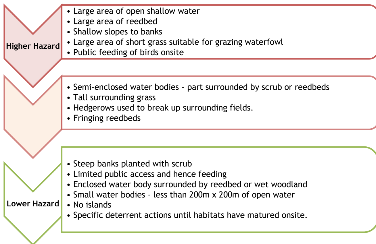
Figure 3. Relative hazard and risk that may be generated by different site design and indication of general biodiversity value. Developed from 'Taking account of aviation hazards in the development of a Wetland Vision for England' 9